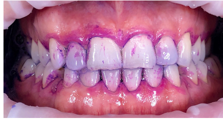
Figure 2: Disclose - the second step of GBT

We also discussed whitening options. The patient was told that a dental hygienist can only perform whitening under the prescription of a dentist and that a check-up would be required.