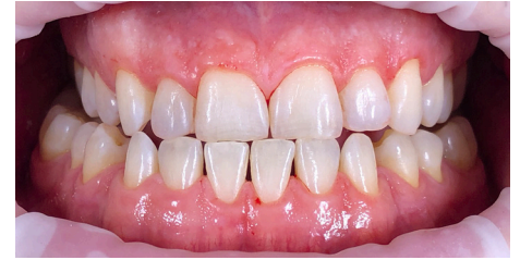
Figure 3: After guided biofilm therapy

He had been using a manual toothbrush and performed interdental cleaning once a